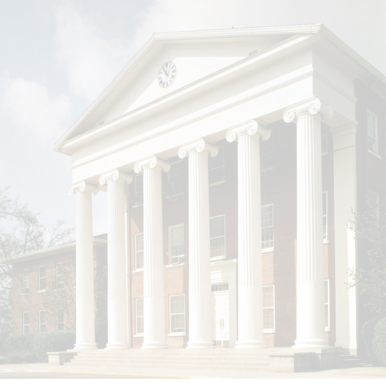
Cost & Effectiveness