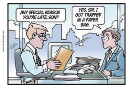
DOONESBURY © 2011 G. B. Trudeau. Reprinted with permission of UNIVERSAL UCLICK. All rights reserved.